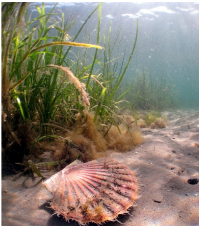
Images: Eelgrass in the Helford.

The publicity attached to the dispute in Studland has given rise to some fears but the situation in the Helford is fundamentally different. We have a well established voluntary approach based on cooperation and it seems to work very well.